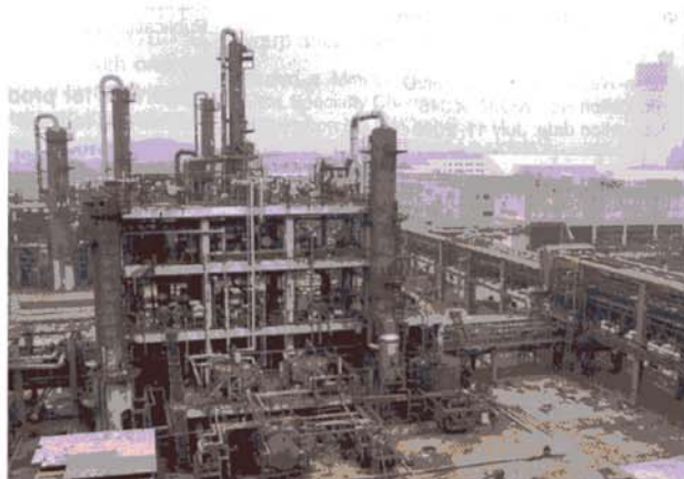
Fig. 2 Caprolactam plant of DSM Nanjing Chemical Industries (DNCI)