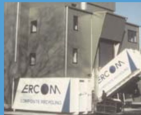
Companies such as Ercom have validated the concept of mechanical composite recycling

It is vital that integral concepts are developed to effectively reuse the FRP recyclate. Only through the development of new, sustainable, environmentally friendly and economically viable concepts for the recycling and reuse of composite materials, the future of composites in key market segments will be secured. This is the challenge being addressed through the 'European Composite Recycling Concept.'