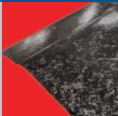
Moulded panel made from Atlac based CF-SMC