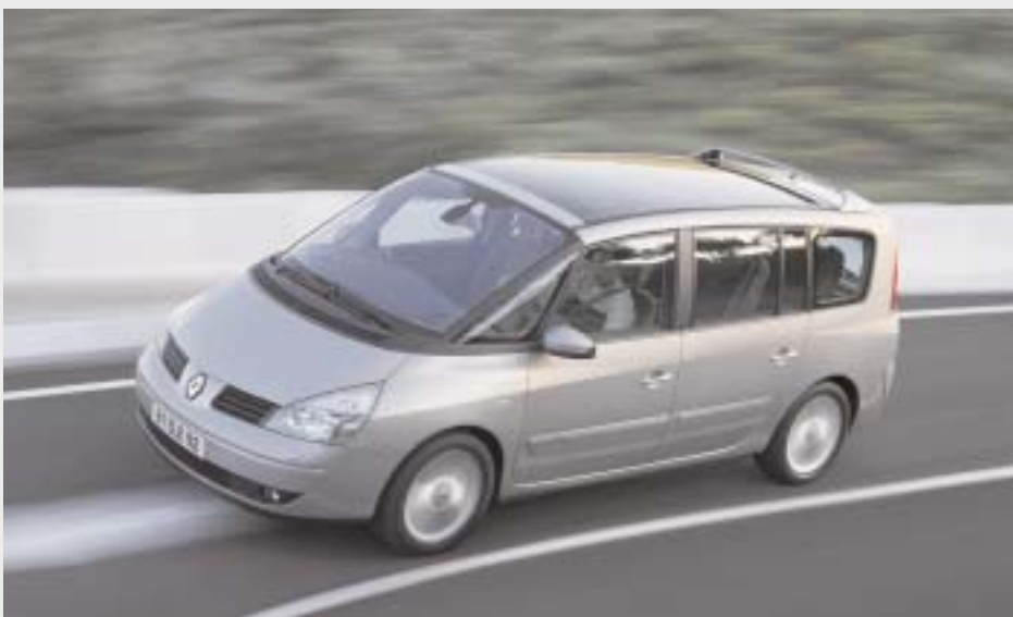
The new Renault Grand Espace.

For more information: visit www.gprmc.be or contact Fons Harbers ( fons.harbers@dsm.com )