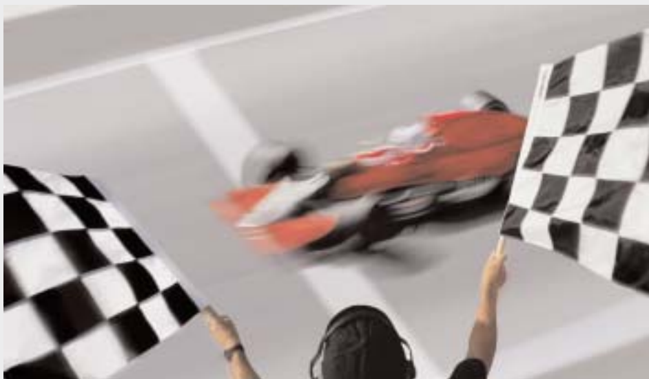
Carbon Fiber Composites are now available for volume applications