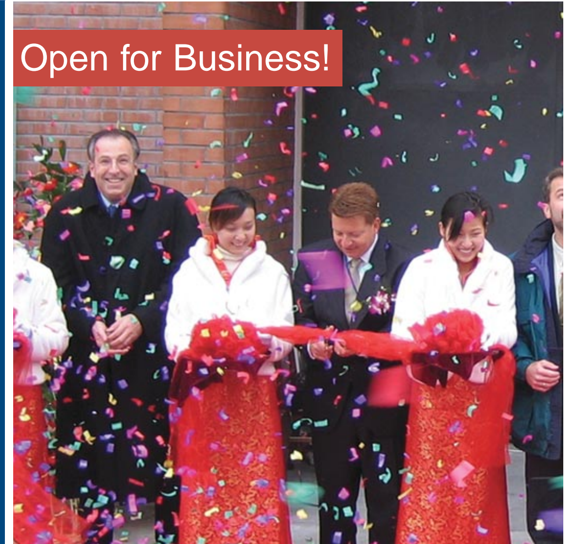
Above: Celebrating the opening of Desotech's newest manufacturing facility, DSM Desotech Specialty Chemicals (Shanghai) Ltd. (see page 2)

Plus: Bufferlite™ 3000 Series Materials named among the Top Products of 2004 by Wire & Cable Technology International! (see page 3)