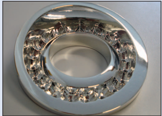
Prototype lamp after metal coating

More information Tel: +33 (5) 5506 1717 www.axishello.com