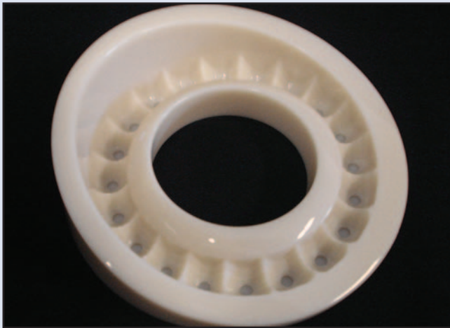
Prototype lamp in NanoTool™ before metal coating