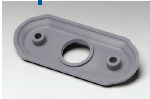
Figure 1 (above): Polypropylene Injection molded bottle cap. Mold made from NanoTool™.