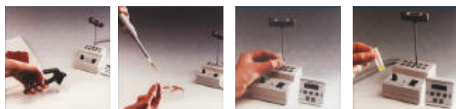
Colour range of the Premi® Test.

Premi®Test is based on inhibition of the growth of Bacillus stearothermophilus , a thermophilic bacterium very sensitive to many antibiotics and sulpha compounds. A standardised number of spores is imbedded in an agar medium with selected nutrients. When Premi®Test is heated at 64°C, the spores will germinate. The germinated spores will multiply with the production of acid in case no inhibitory substances are present. This will be visible by a colour change from purple to yellow of the indicator Bromocresol purple, added to the agar medium. When antibacterial compounds are present in sufficient amount (above the detection level) no growth will obtain and the colour remains purple.