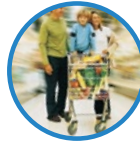
Commercial & Retail