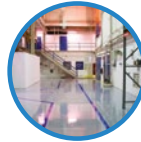
Warehouse & Distribution