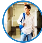
Schools & Universities