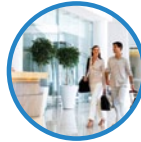
Hospitality & Entertainment