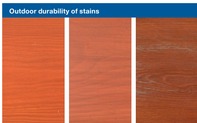
PU480 original PU480 exposed acrylic emulsion exposed