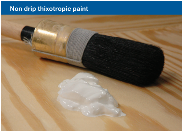
Table 1: Comparison of Uralac® HS230 with a mixture of Uralac® HS230 and Urathix® AT232