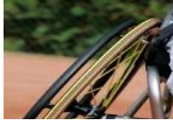
First Stanyl® cogwheels used by Paralympic hand bikers