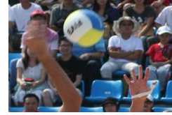
DSM becomes sponsor of the national American men's and women's (Beach-) Volleyball teams