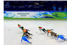
DSM develops new skating suit for Dutch Short track team using Dyneema®