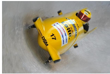
DSM co-develops new Olympic bobsleigh with NOC*NSF