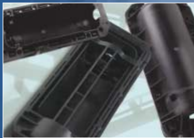
Akulon® lends toughness and thermal stability to airbag canister housings.