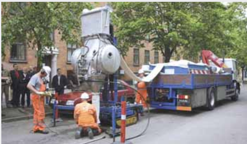
Installation of Aarsleff CIPP-liner at Danisco.

The benefits of relining are clear: no serious disturbance to normal production and operational processes - no trenching or digging up of damaged sewer lines. The use of Atlac resins ensure optimum liner performance by both hot cure and UV cure.