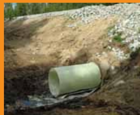
Renovated Railway tunnel.

The success of the Inpipe liner, based on DSM's Palatal A400I-26, UV-curable isophthalic based unsaturated polyester, is down to the high flexibility of the system. The liner can be used in all configurations of pipes or tunnels; whether it's circular, square, egg shaped or any other shape. Fast curing speed is a particular benefit in short lengths and the relatively light equipment needed for the installation work makes it possible to use the system in areas with difficult access.