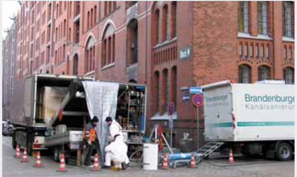
Installation in historical city of Hamburg

The liner was transported to Hamburg in a special, light tight box to prevent premature polymerisation of the resin. It was then drawn through the old sewer and expanded by air pressure so it fixed to the inner wall. The liner was then completely cured by moving a track of 6 UV-lamps of 1000W each at a defined speed of 30 metres/hour. Total curing time was just two hours for the shorter and six hours for the longer liner. Quality checks carried out by Ingenieurburo Siebert showed that all HSE requirements - water tightness of the liner, liner thickness, flexural strength and flexural modulus - were all easily fulfilled.