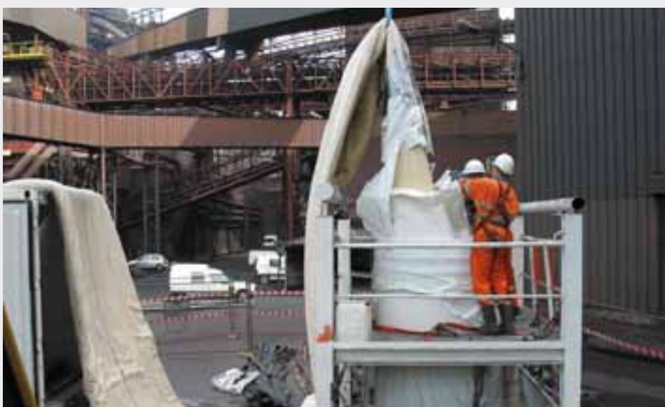
Installation of vinyl ester liner at SOLLAC.

pipework, and provides a smooth, close-fitting, durable liner in pipes of both circular and non-circular cross-section. This wide range of uses is shown in the list of recent examples of industrial applications of this technique in Europe. In all cases DSM's resins were applied. The most important criteria for resin selection are the temperature and chemical resistance requirements for the system, as these factors ensure a long service life.