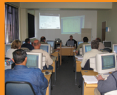
Training course in South Africa

As Jeroen van Brussel commented: "through education and training we will increase the knowledge on FRP materials and promote the