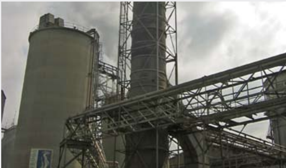
Atlac 382 stack in South Africa

As well as resin choice, the design of the system is equally important. By training engineers in the principles of FRP design, DSM Composite Resins shows its commitment to the anti-corrosion industry (see page 3) and builds greater understanding of the many possibilities and benefits that FRP brings to this industry.