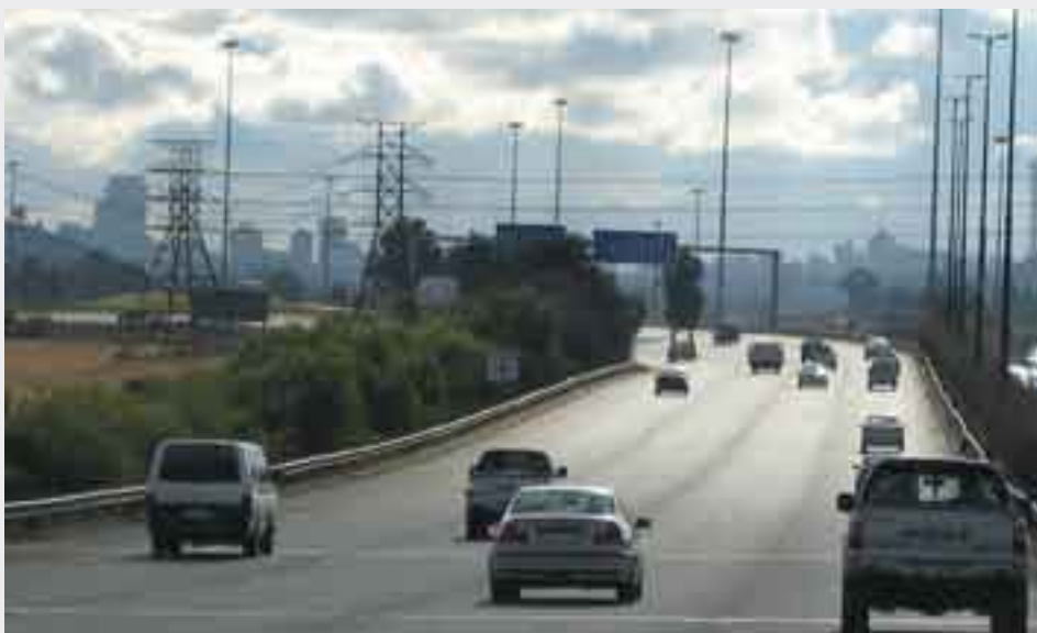
South Africa's chemical and mining industry offering large opportunities for FRP materials

Engineers from Fibre-Wound and Impala Platinum Ltd have regularly monitored the stack. They've hardly needed to make any repairs and over the last 30 years the stack has operated successfully. There's no reason to believe it won't survive for another 30 years.