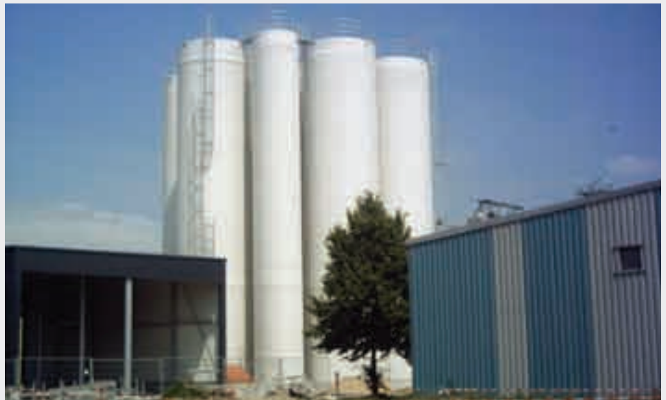
Atlac storage tanks at biodiesel plant in Emmen

Biodiesel can be operated in any diesel engine with little or no modification to the engine or the fuel system. Biodiesel has a solvent effect that may release deposits accumulated on tank walls and pipes from previous diesel fuel storage. The release of deposits may clog filters initially and precautions should be taken. Use only fuel meeting the biodiesel specification!