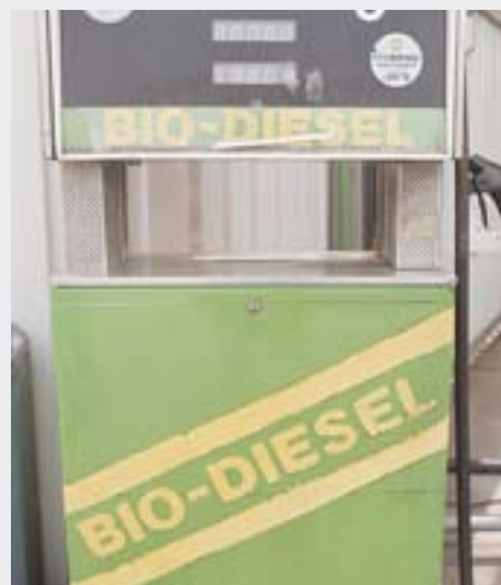
Biodiesel fuel station

The tanks have an Atlac 430 chemical resistant layer of 2,5 mm thickness according to ISO 13121. This well established vinyl ester is a workhorse resin for many applications where chemical resistance and/or temperature resistance is needed. Polem benefits from the easy processing of this resin both in spray-up processing (for tank roofs and bases) and spray winding (for vessels used to store a wide range of products).